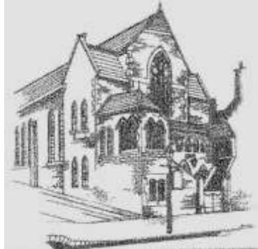
Church Street, 1868 - 1971