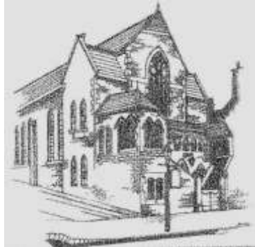
Church Street, 1868 - 1971