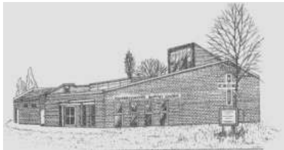
Franche Road, 1971 - 2008

200 th Anniversary Souvenir History Booklet