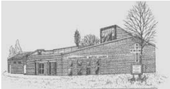
Franche Road, 1971 - 2008

200 th Anniversary Souvenir History Booklet