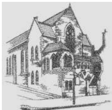
Church Street, 1868 - 1971